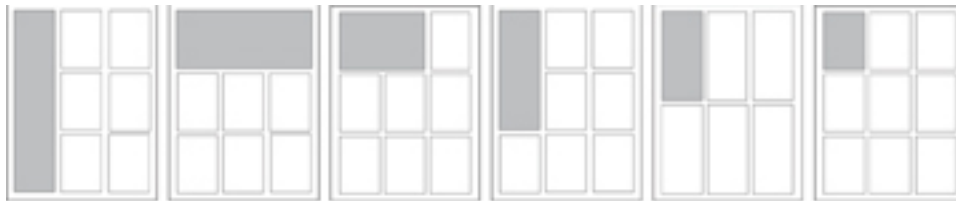
1/3 page vertical Width: 2 1/4" Height: 9 3/4"